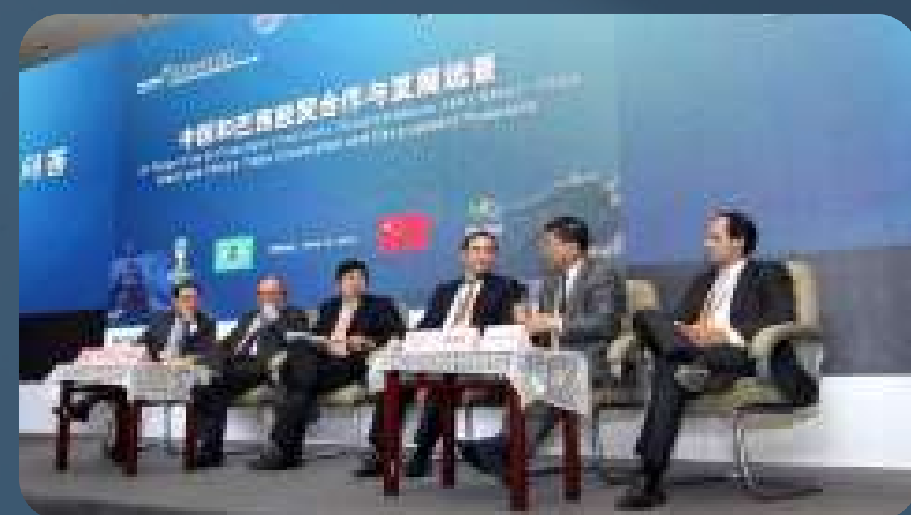
Discussion panel and questions and answers